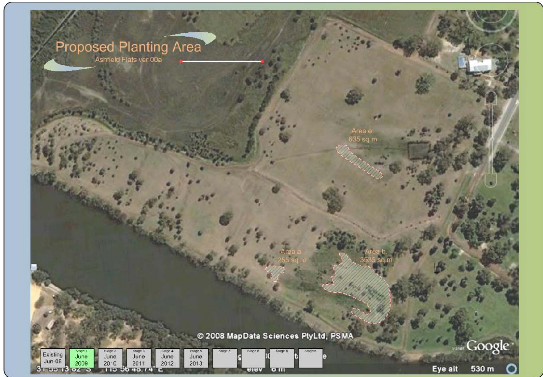
Figure 2 - Location of planting at Ashfield Flats for 2009