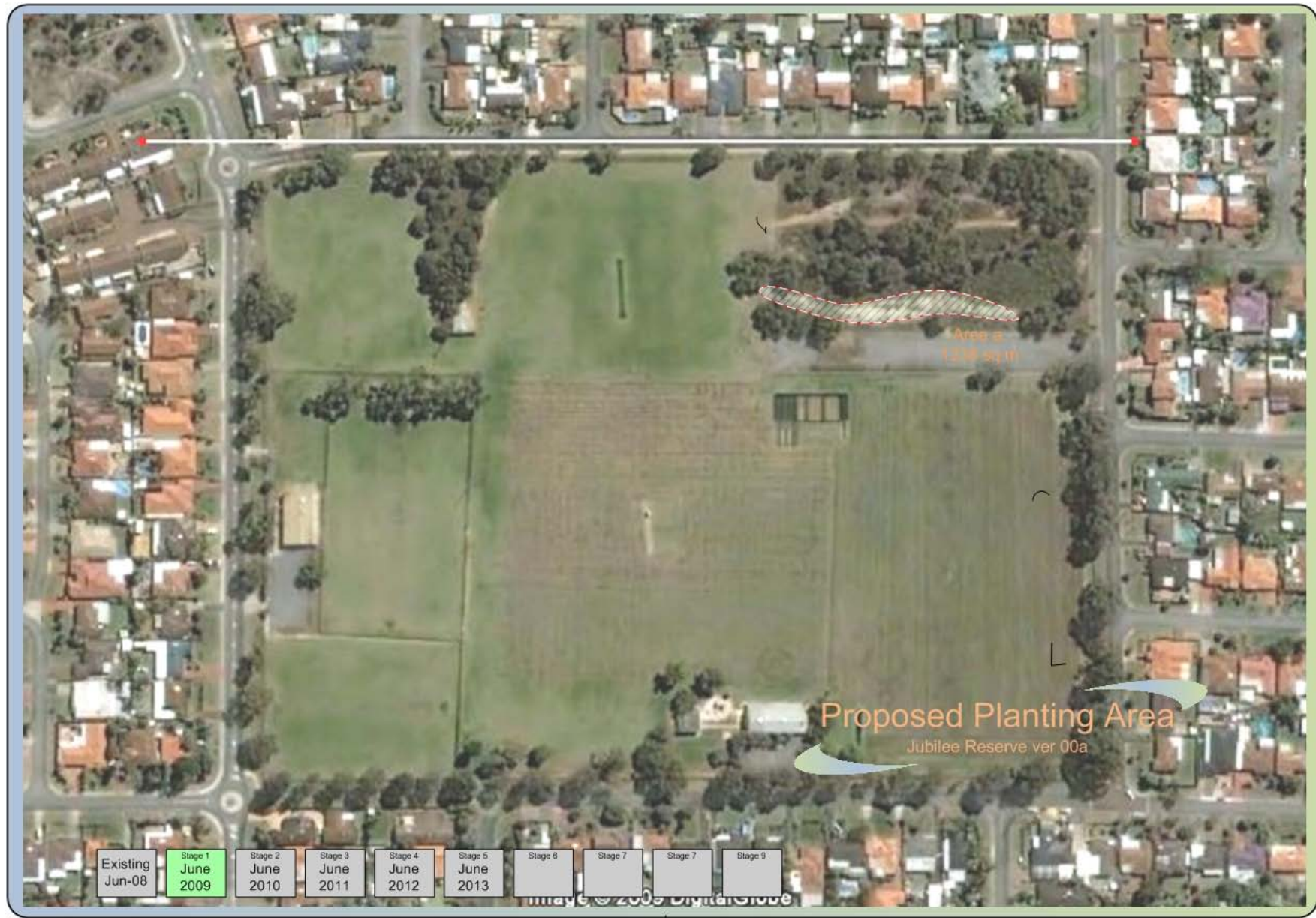
Figure 3 - Location of Eden Hill Primary School Project Planting for 2009