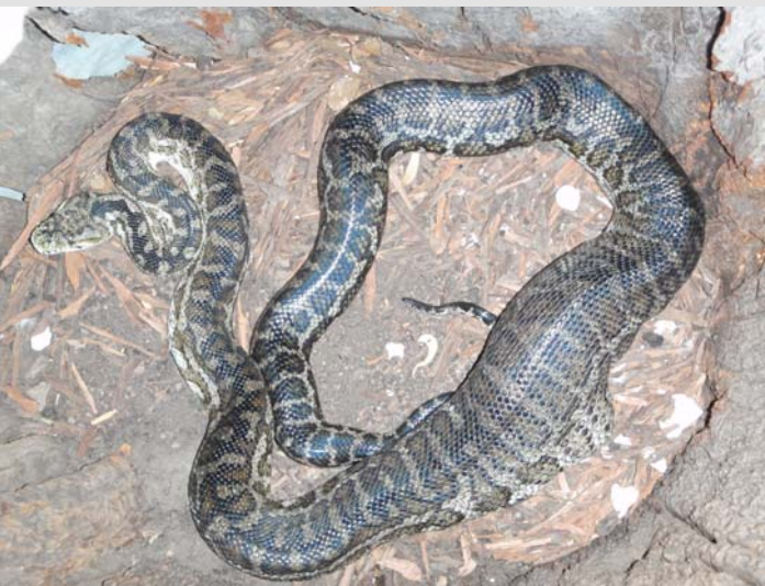
A Carpet Python in hollow after eating a Carnaby's Black-Cockatoo. Note the CBC-shaped bulge.

diet, movements, nestling growth, vocalisations and breeding success of the species (see Saunders 1979 Aust. Wildl. Res. 6: 205–16, 1980 Aust. Wildl. Res. 7: 257–69, 1982 Ibis 124: 422–55, 1983 Aust. Wildl. Res. 10: 527–36, 1986 Aust. Wildl. Res. 13: 261–73; Saunders and Ingram 1998 Pac. Cons. Biol. 4: 261–270). We conducted detailed studies of the population at Coomallo Creek from 1969 to 1977, visiting the area up to 25 times in some breeding seasons. Between 1978 and 1996 we monitored the population over 12 seasons. Monitoring consisted of visits to the area for three days in September and again in November. During these visits all nest hollows were checked, hollow contents recorded, all chicks measured and banded, and searches conducted for banded adults. Between 1969 and 1996, as result of clearing of native