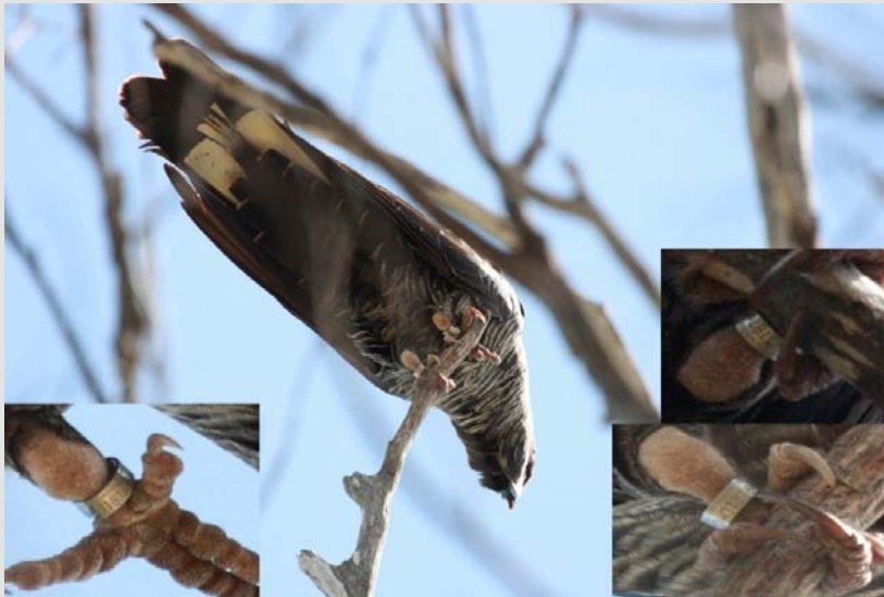
Above: Female 210-01876 on 17 th September 2009. This female was at least 25 years old.